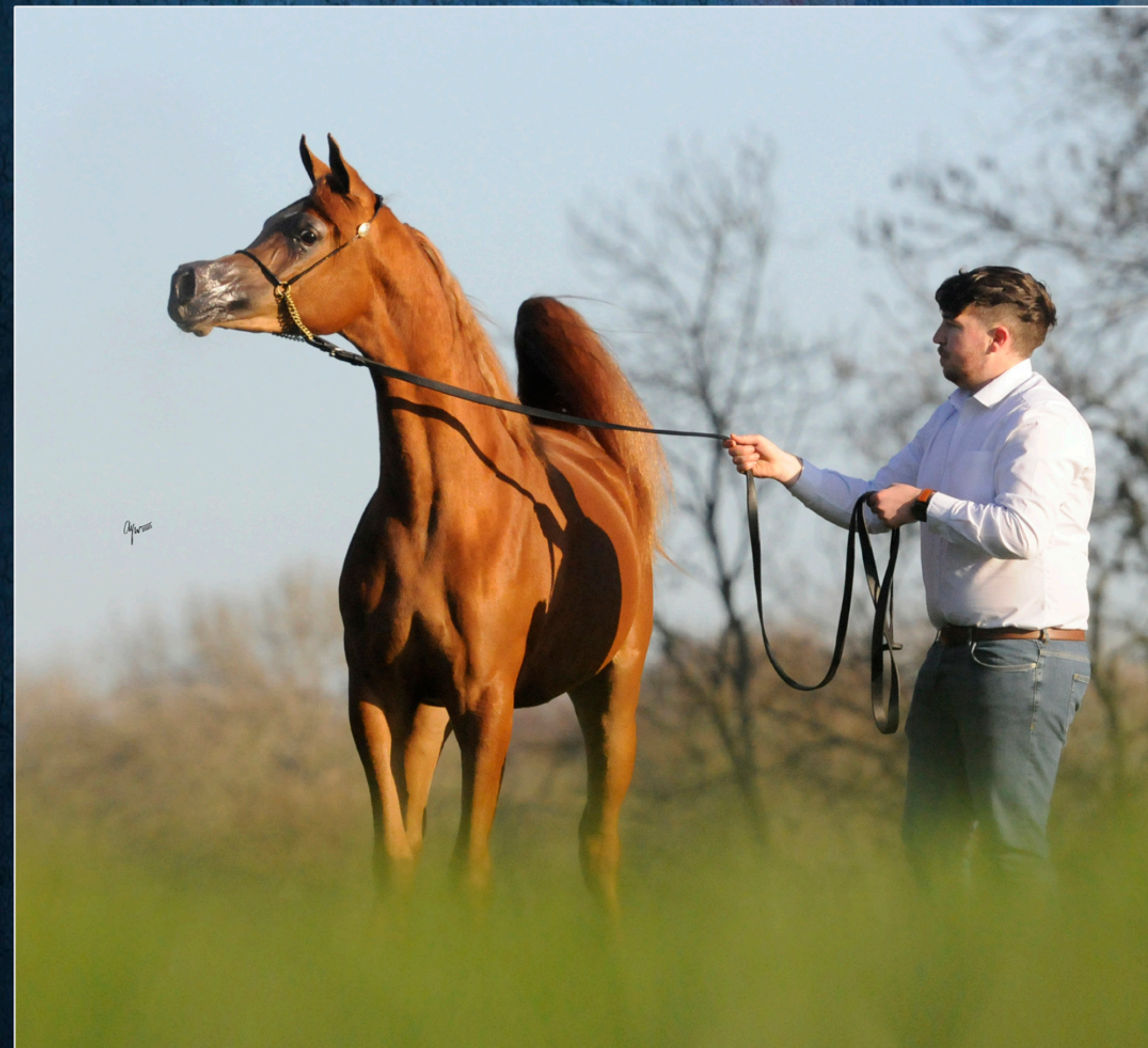
NAIFAT AL OWAlDAH, PROUDLY BRED & OWNED BY AL OWAlDAH STUD, KSA