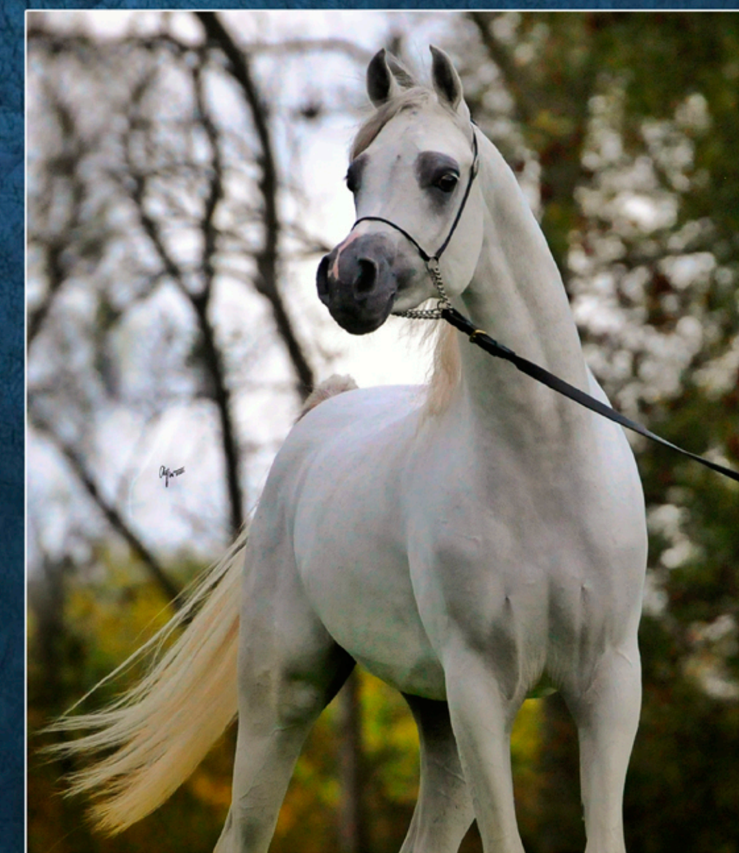
PANDOREZ O - OWNED BY JALYLA ARABIANS - UK