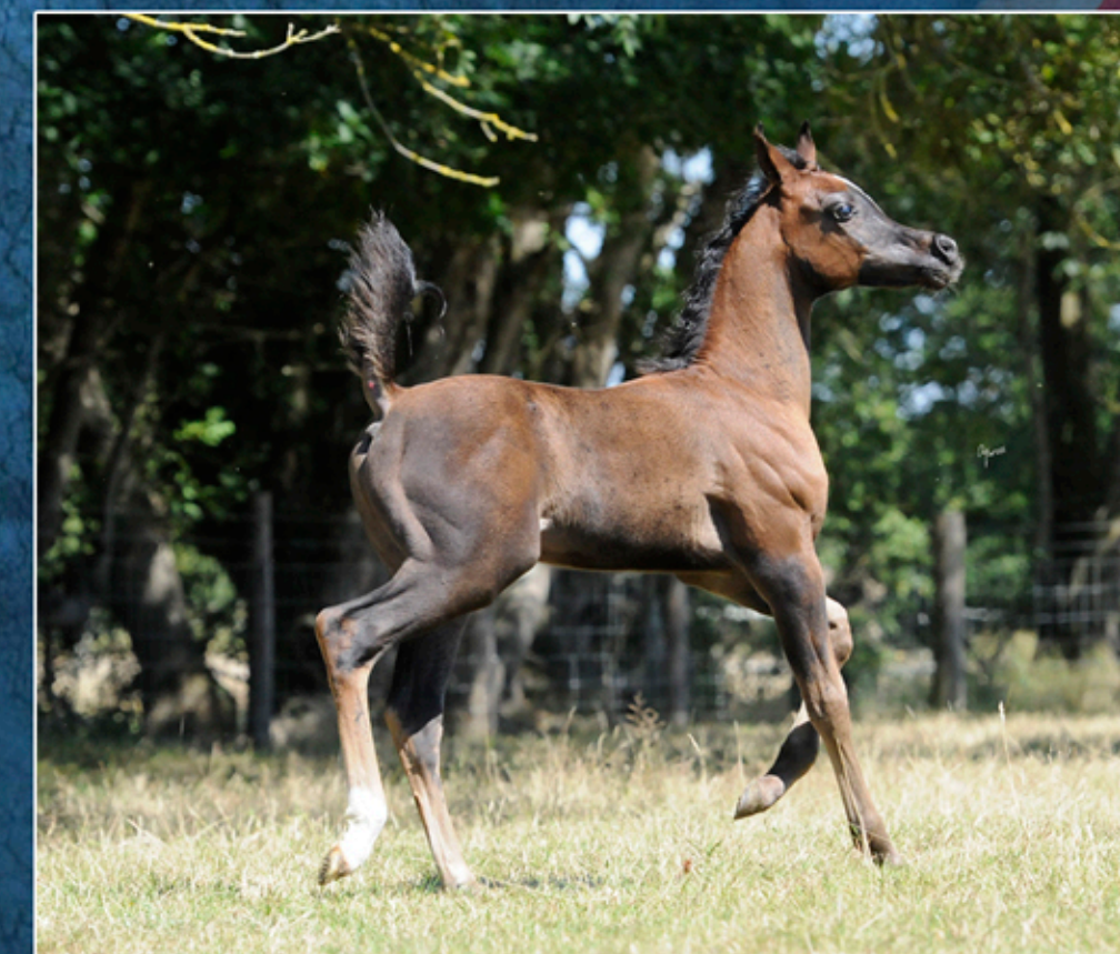
DUCHESS AMAIYAA DMC & DUKE MAXIIM IBN MASSAI - BOTH BRED BY ARABIANS IMPERIAL UK