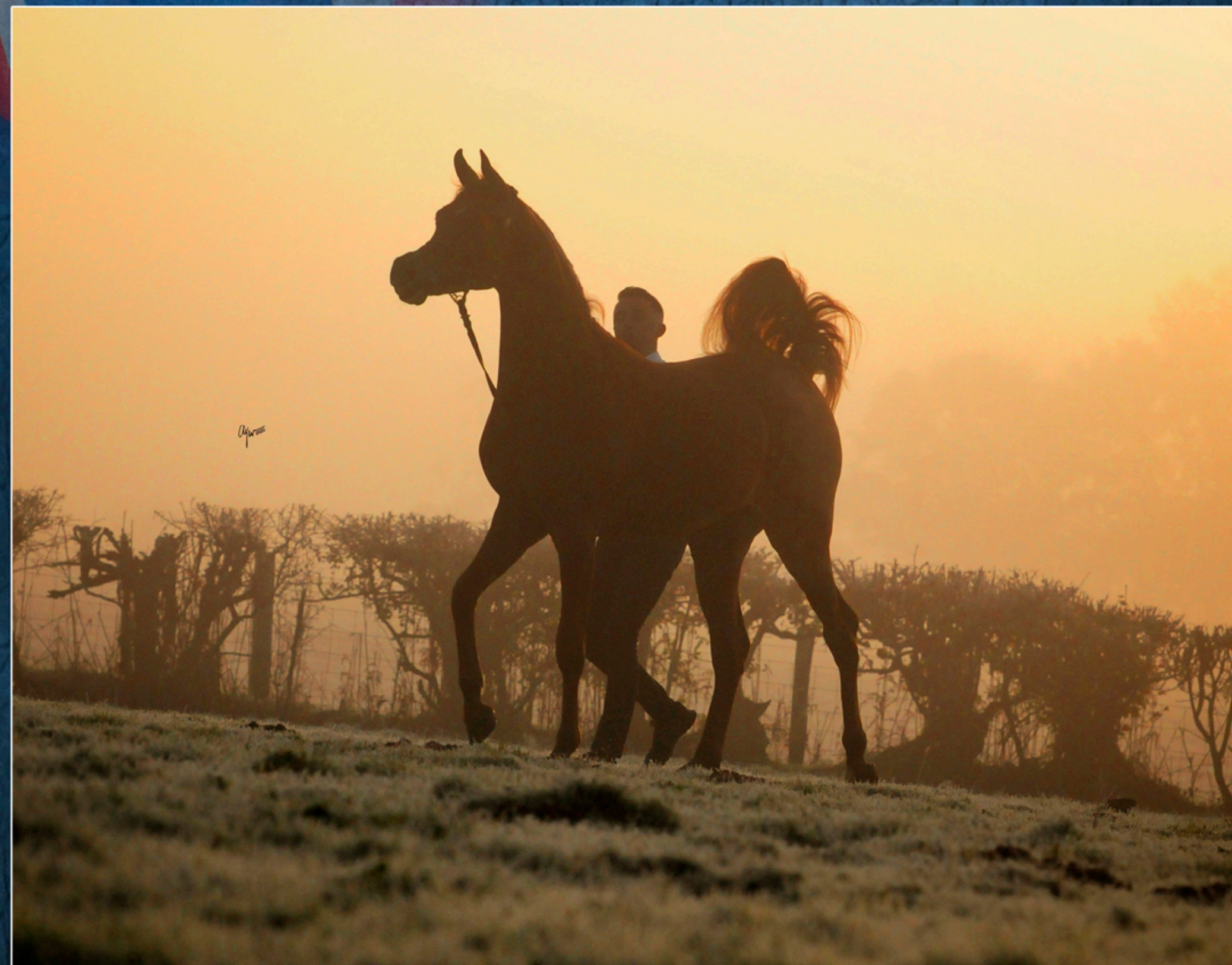
NAIFAT AL OWAIDAH - FULLSISTER TO WORLD CHAMPION LR ERA DE EXCALIBUR