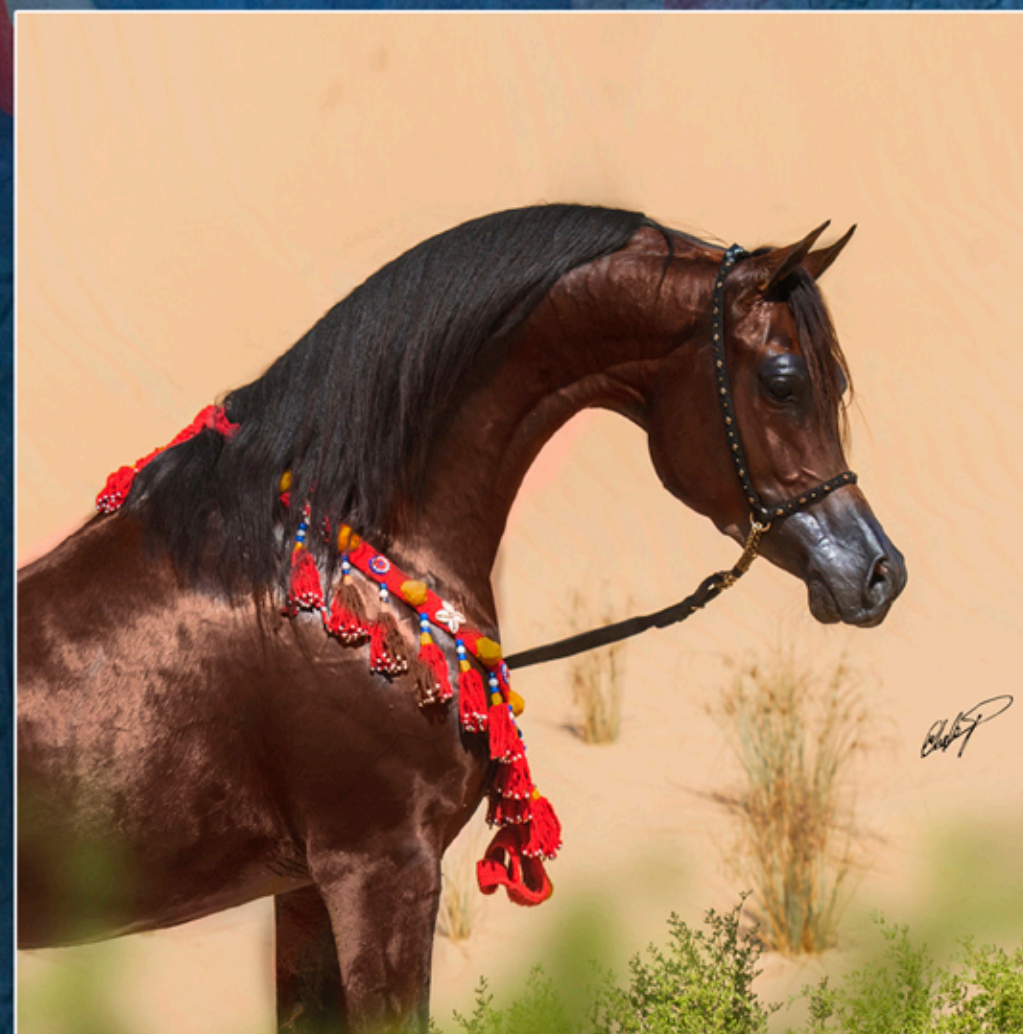
BATTAL AL ZOB AIR